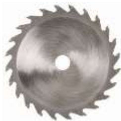
Fig-2: Cutting Tool

A circular saw is a power-saw using a toothed or abrasive disc or blade to cut different materials using a rotary motion spinning around an arbor. A circular saw is a tool for cutting many materials such as wood, masonry, plastic, or metal and may be hand-held or mounted to a machine. Circular saw blades are specially designed for each particular material they are intended to cut and in cutting wood are specifically designed for making rip-cut cross-cuts, or a combination of both.