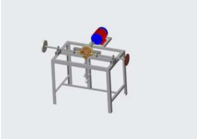
Fig-4: Design of Multi-Purpose Mechanical Machine