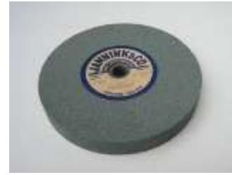
Fig-3: Grinding Tool

A grinding machine, often shortened to grinder, is any of various power tools or machine tools used for grinding, which is a type of machining using an abrasive wheel as the cutting tool. Each grain of abrasive on the wheel's surface cuts a small chip from the workpiece via shear deformation. Grinding is used to finish workpieces that must show high surface quality (e.g., low surface roughness) and high accuracy of shape and dimension. As the accuracy in dimensions in grinding is on the order of 0.00025 mm, in most applications it tends to be a finishing operation and removes comparatively little metal, about 0.25 to 0.50 mm depth. However, there are some roughing applications in which grinding removes high volumes of metal quite rapidly. Thus, grinding is a diverse field.