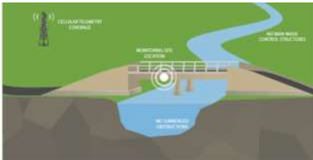
Figure 1: Flood Flow Monitoring

[7] presented a brief description about implementation of the sensor network in Honduras for an early detection of flood & alert the community. They have analyzed on the significance on sensor networks in developing countries, sensor networks for flood detection and the available current operational systems for flood detection.