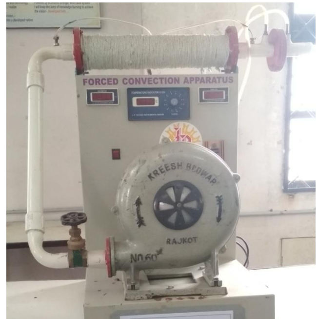
Fig.2.1 Experimental Setup

The force convection devices are categorise into coating, rough surface, turbulent or swirl flow, twisted tape[1,2] , helical screw I and wire coil[3]