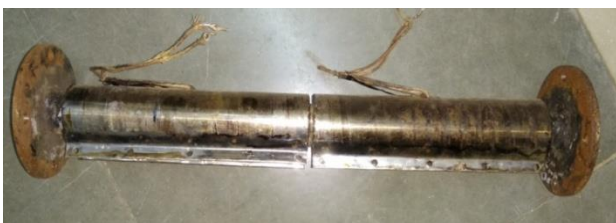
Fig.2.3 Test Section