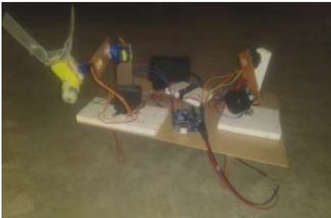
Fig-2.Haptic Robotic Arm

It is used for the movements of Robotic arm. Camera: this are Mounted on the Robot for controlling and observing motive