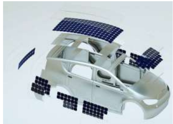
Fig 1: Panel arrangement.

When these eco-friendly cars are accelerated, the battery propels energy to drive the electric motor and in return help the vehicle to move. A solar car has the ability to generally work in voltage range of 80 – 170 V and can have a driving range of about 50-100 km.