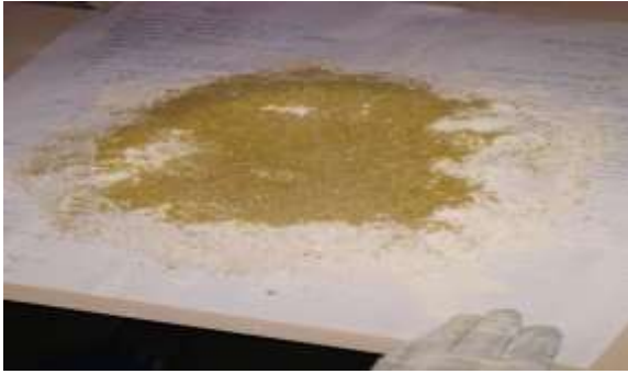
Fig.5: Trichoderma Bio-fertilizer Product