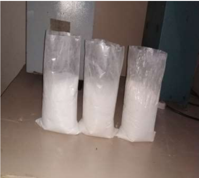
Fig.6: Trichoderma Bio-fertilizer Product

The fig.1 is Trichoderma viride in the test tube and Petri plate for the cultivation in the sorghum seed.