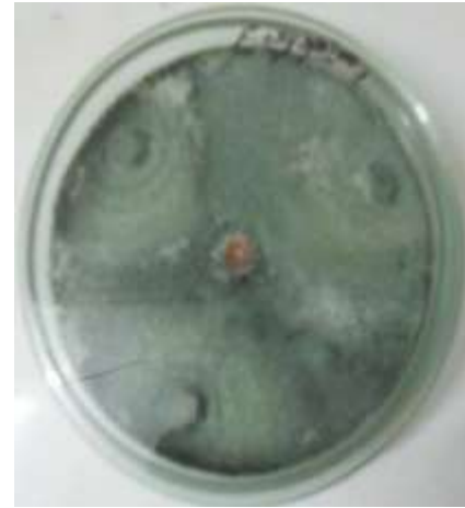
Fig.2: Trichoderma viride