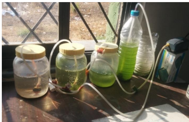
Fig. 7 After 12 days algae will be deposited in bottle

Now, we took algae from each bottle and took it on filter paper and dried it and weighted we got result :-