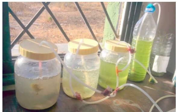
Fig- 5: Within 7-9 days growth of algae