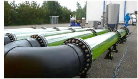
Fig. 2. Close loop system