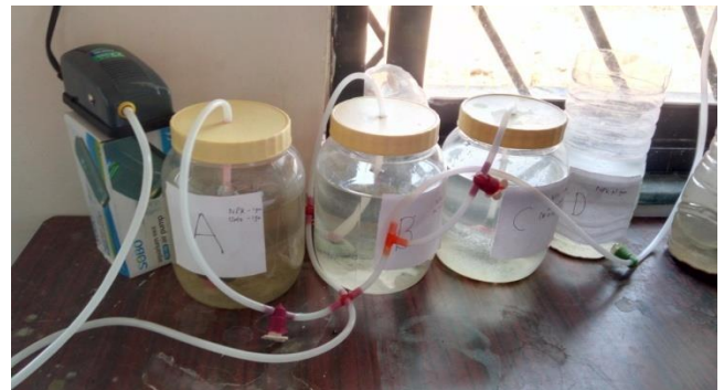
Fig-4: Within 1-6 days