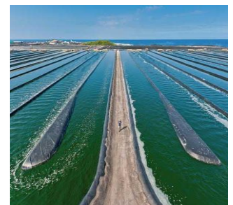
Fig.3 Open pond system