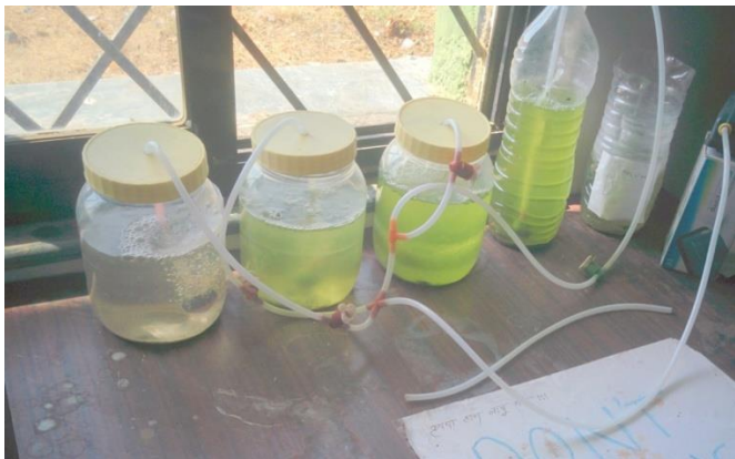
Fig. 6 Within 10-12 days more greenish colour found

bottle (C),(D) and colour of bottle (A) remained unchanged.