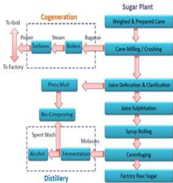
Fig. 1: Flow Chart of Sugar and Bagasse