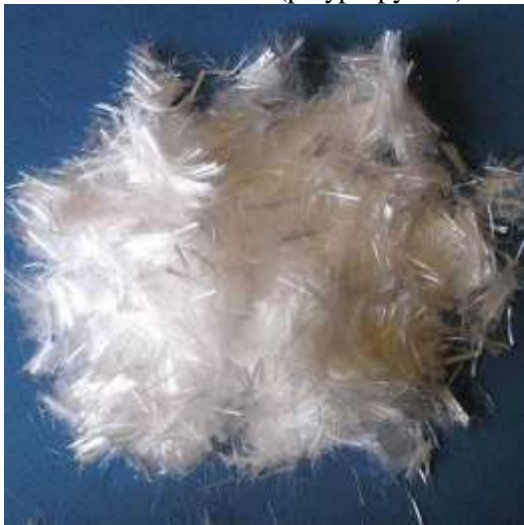
Fig. 1: Polypropylene fibre