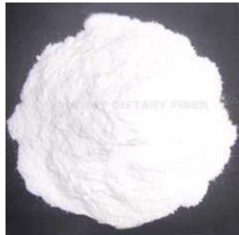
Fig:- 2 Lime