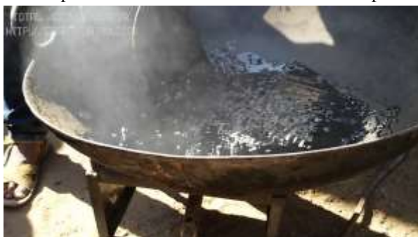
Fig-2: Burning procedure for brick making

After batching, the sand was burned in the head pan at the considerable temperature of 28 to 45 degree Celsius. Plastic wastes were thrown into the head pan step by step in desired quantity and was allowed to melt in it. The first step of burning process includes the arrangement of stones, head pan and the required firewood. The stones are arranged to hold the head pan and the firewood is placed in the gap between stones and it is ignited. The head pan is placed over the setup and it is heated to remove the moisture present in it