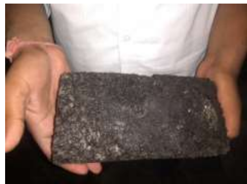
Fig-3 Manufactured plastic sand brick

The mixture is then poured into the brick mould of size (19x9x9) cm and is compacted by using tamping rod or steel rod. The surface is finished by using trowel. Before placing the mixture into the mould, the sides of the mould are oiled to easy removal of bricks. Moulds are removed after 24 hours.