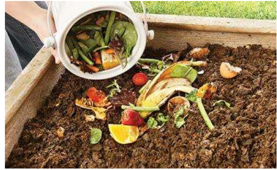
Fig-4: Kitchen waste