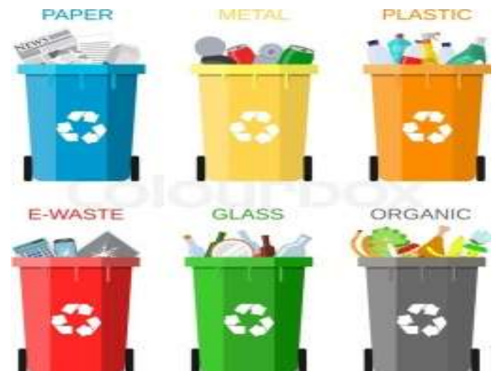
Fig-2: Waste segregation

The types of waste that you have will impact how you segregate it. This type of segregation is perfect for general household waste such as paper or cardboard. If your waste is hazardous you will have to segregate it from other forms of waste and dispose of it correctly.