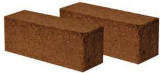
Fig-5: Cocopeat block