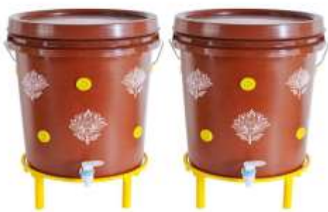
Fig-3: Composting bin