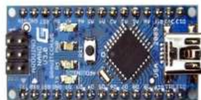
Fig-2: Arduino Nano