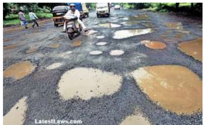
Fig-1: Potholes on roads

buzzer. As soon as the pothole is detected the buzzer starts beeping by alerting the rider.