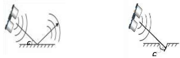
Fig-4: Ultrasonic Sensor working on a) plain ground and b) pothole

For the task of obstacle detection, the ultrasonic sensor mounted at the bottom of the vehicle sends ultrasonic waves towards the below ground and starts the timer. The timer is stopped when the waves reflected from the ground are received(As the pothole is detected).