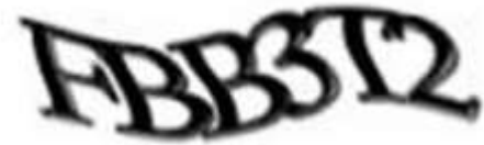
Fig 3: MSN Text CAPTCHA