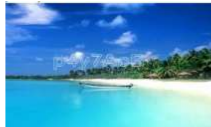
Fig 5: Transparent CAPTCHA