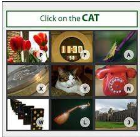
Fig 6: Image based CAPTCHA