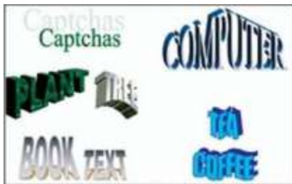
Fig 1: Gimpy CAPTCHA