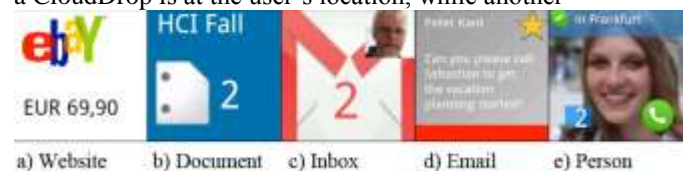
Figure 4. Content types and their visualizations, as they are supported by a CloudDrop.

Synchronous communication: For synchronous communication, the user can make a phone call by holding the CloudDrop close to a PC, tablet or smart phone and touching the "call" button. The call is then initiated on the other computing device. Since the entire communication is handled via Skype, the remote partner does not need to have CloudDrops in order to participate in the communication. Finally, the platform supports lightweight communication in-between two CloudDrops. Suppose that a CloudDrop is at the user's location, while another