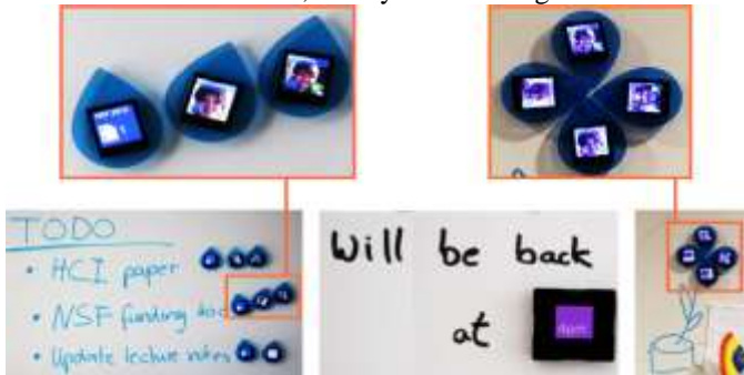
Figure 1. CloudDrops help users stay aware of dynamic Web-based information and support flexible spatial layouts in architectural space

exclusively rely on upon an individual's efforts. The enduser can flexibly arrange the set of stamp-sized displays, locate them at meaningful places and thereby easily instrument, orchestrate and reconfigure his or her personal information environment, to stay aware of digital information.