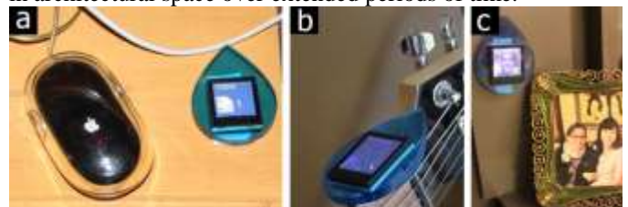
Figure . Emerging practices performed by users: a) P7 placed a CloudDrop associated to a TODO document prominently on her desk. b) P3 attached a CloudDrop associated with her guitar teacher onto the guitar. c) P1 attached a CloudDrop onto a

as well as interpersonal communication. Future work should examine in more detail how people use tiny displays in architectural space over extended periods of time.