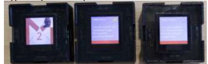
Figure 5. Varying the degree of awareness information by adding or removing CloudDrops to a puddle.

CloudDrop is at the remote user's place and both are associated with the other user. Like knocking on a physical door or a porthole, the user can touch the display; then the remote Cloud Drop lights up. This enables rich and direct communication patterns, e.g., fast knocking in urgent cases or knocking in a specific rhythm to share a mood. If the user