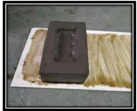
FIG: SAMPLE OF BRICK