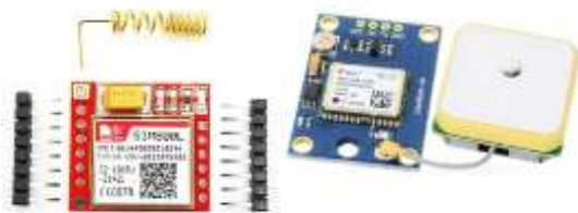
Fig 4.3- GSM and GPS Module

GSM is stands for Global System for Mobile communication. A GSM modem requires a SIM card to be operated and operates over a network range subscribed by the network operator. GSM transfer the signal from smart band to smart phone and also used to send emergency message to the family member, friend and nearby police station. It track the current location of victim with the help of latitude and longitude of receiver. GPS stands for Global Positioning System is a location tracker. It tracks the current location of victim in the form of longitude and latitude. The GPS Coder Module will use this information to search an exact address of that location as the street name, nearby junction etc. which is directly connected to USART of the microcontroller provides reliable positioning, navigation, and timing services to worldwide users on a continuous basis in all weather, day and night, anywhere on or near the Earth.