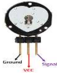
Fig 4.2- Pulse rate sensor