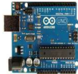
Fig 4.2-Arduino Uno

Basic building block of propose system is arduino. The hardware consists of the following features- the USB plug which is used to upload the program into the board. It can also be used as a source of power supply. The plug supplies a regulated voltage of 5V. In case it is insufficient, an external power supply of 9 to 12V can be given. There are 5 analog pins (A0 to A5). The digital i/o pins are from 2 to 13. The reset button is used to reset the microcontroller in order to run a fresh program. There are 3.3V and 5V power pins to power the Arduino.