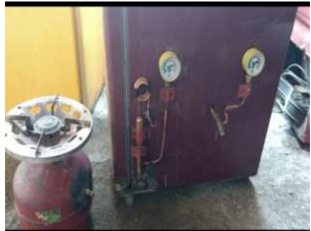
Fig (b): Actual working

In this project we are going to fabricate and showing the simple mechanism of LPG using in the domestic air conditioning and the cooking purpose.