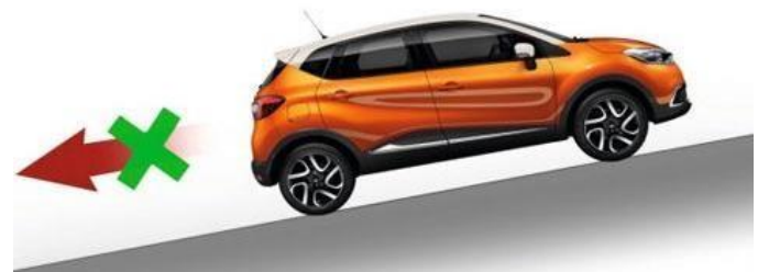
Figure 4. Drive-away Assistance at hills or inclinations

A “drive-away assistant” prevents the vehicle from rolling backwards or forward when starting on a hill or steep incline. A stiff push onto the brake pedal, and the car remains stopped, even when taking the foot off the brake pedal, until the driver accelerates and the vehicle begins to roll. Mercedes drivers usually tend to enjoy this feature. It was first introduced in the spring of 2003 in the 04 E-class Estate and later on in the 2004 SLs [12]. Figure 4. must have given you the gist of the Drive-away assistance at a glance.