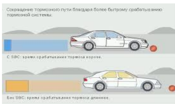
Figure 3. Comparison between Stopping by SBC and Conventional Braking System

SBC already recognises the driver's rapid movement from the accelerator onto the brake pedal as a clue to an imminent emergency stop and responds automatically. As a result of this, the stopping distance of a SBC equipped car from a speed of 120km/hr is cut by around three percent compared to a car featuring conventional braking technology as shown in figure 3 [5].