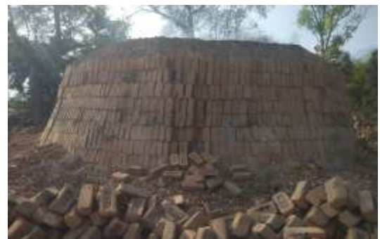
Fig-17 Fired brick kiln

The whole layer is now set to fire through a window provided at the bottom base with a large size coal pieces. Or the whole setup can also be run on the soybean husk waste. (Required quantity will be more as compare to coal)