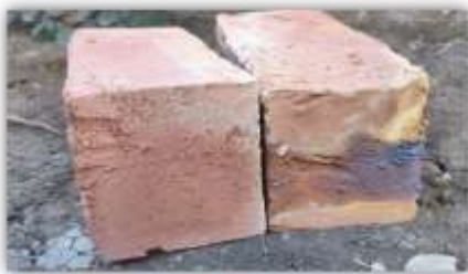
Fig-20 Efflorescence test

A good brick should not contain soluble salts. The presence of soluble salts in bricks leads to the formation of efflorescence in the bricks, which deteriorates the quality of the bricks.