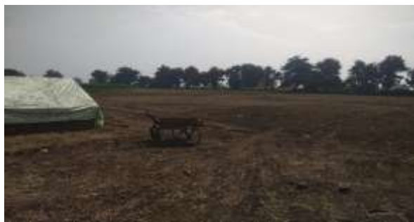
Fig-9 Level Plain 2