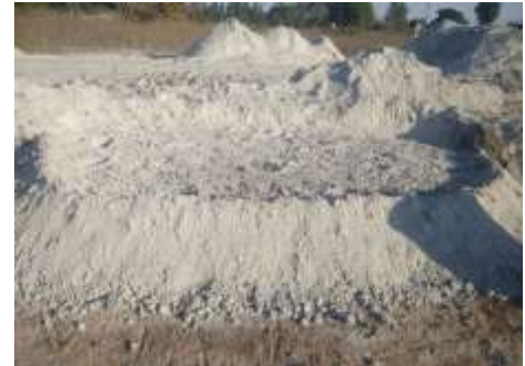
Fig-10 Dry Mix