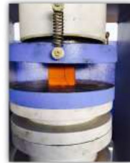
Fig-23 Crushing Strength test

Crushing Strength Test because bricks used for bricks are generally subjected to compressive loads, the compressive strength of bricks must be determined.