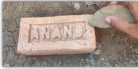
Fig-19 Hardness test

The hardness of a brick usually refers to the scratch resistance of the brick.