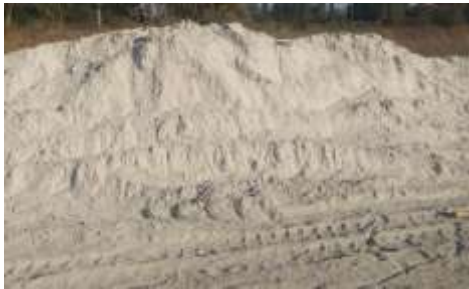
Fig-3 Fly ash

Fly ash is a product of coal combustion and consists of solid particles (fine particles of the burned fuel) that are removed from coal-fired boilers along with the flue gases. Ash falling to the bottom of the boiler combustion chamber is called ash. In modern coal-fired power plants, fly ash is usually captured by electrostatic precipitators or other particulate filtering equipment before the flue gases reach the chimney. Together with the ash removed from the bottom of the boiler, it is known as coal ash or fly ash.