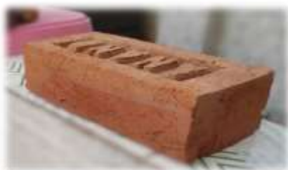
Fig-21 Shape and size test

To maintain the uniformity of the structure, the bricks must be of the same shape and size. A good brick should have a regular rectangular shape with sharp edges.