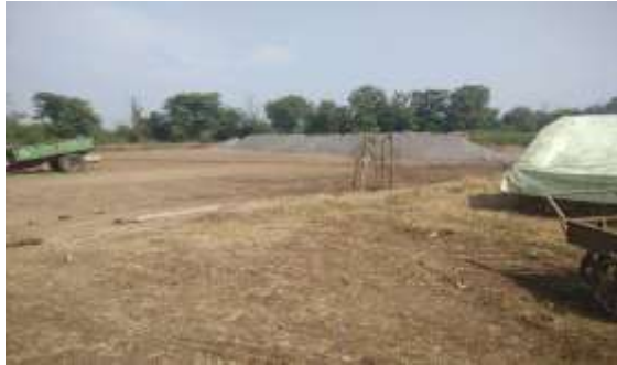
Fig-8 Level Plain 1