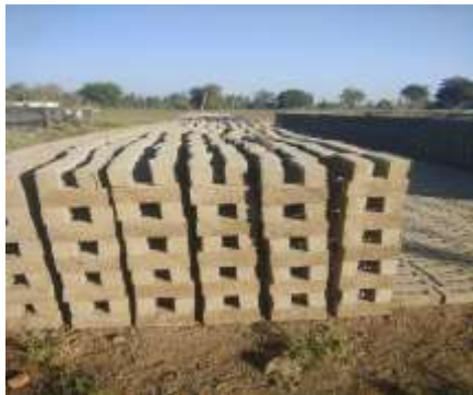
Fig-14 Sun Drying at 7 Day