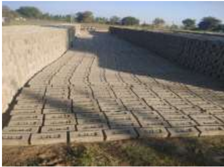
Fig-13 Sun Drying for 3Day