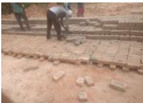
Fig-15 Levelling of batta (brick kiln)

The site must be leveled for making a base of the burner, (Bhatta's) with laying of a Jama bricks at the bottom most level.