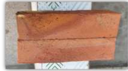
Fig-22 Colour test

The Brick Color Test is simply a visual inspection of a brick for an acceptable bright and uniform color throughout the brick body.