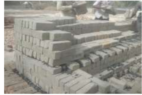
Fig-16 Layering of coal in brick kiln

Now the Jama bricks the layer of coal followed by unburnt clay brick layer (3-5) then again coal layer and so on till the height it needed to be taken.