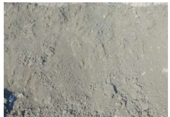
Fig-2 Pure clay soil

Clay contains the smallest particles of any other type of soil. The particles are so densely packed that there is little or no air space. They range from clay to loam. Usually light gray to dark gray.