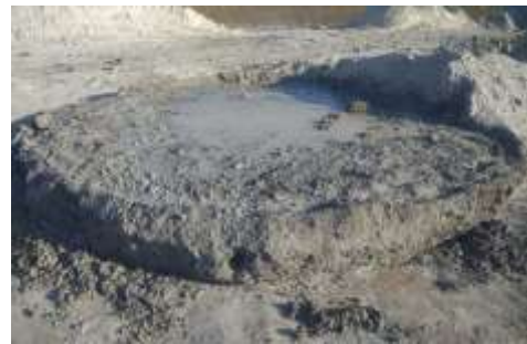
Fig-11 Wet Mix