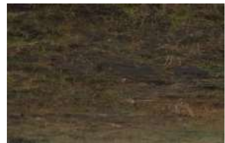
Fig-7 Soybean husk

Soybean husk waste is by product of soybean industry which also has a high calorific value but less than coal.