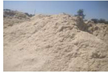
Fig-5 Wheat husk

Wheat husks are lignocellulosic waste, accounting for about 15-20% of wheat, and wheat husks are used to some extent as livestock feed, fuel and additives.