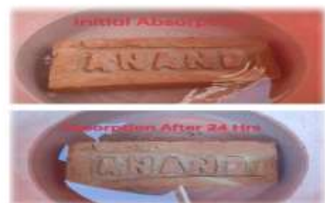
Fig-18 Absorption test

The absorption test can be used as an indicator of the strength properties of a brick, such as the quality of the brick, the degree of charring, and the weathering behavior.